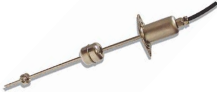
Model CS/CM with IP 67 Housing position sensor Stroke Length: 72 mm to 250 mm (3 in. to 10 in.)